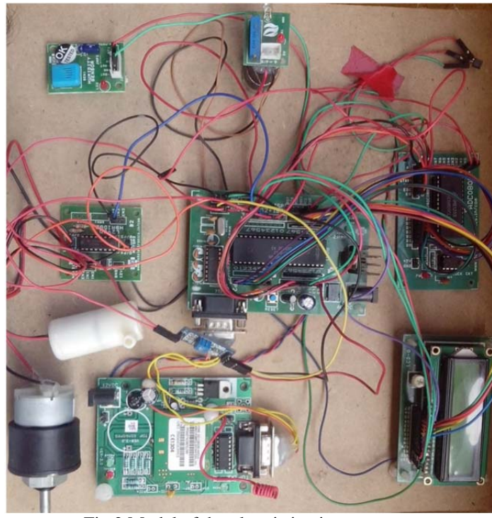
Fig 2 Model of the plant irrigation system

individual by sending sms/message in the meantime water sprinkler will be turned ON, the same procedure will be defeated checking stickiness dampness substance ,soil water dampness content ,mild of the field these detecting information will be in simple structure it will be converted to advanced utilizing ADC0809 then controller will react to relating flag and impel the water pump even we can control the water engine by message. These complete procedures will be done consequently with continuous observing. The critical purpose of this venture is "This task keeps running with both present and additionally sunlight based force".